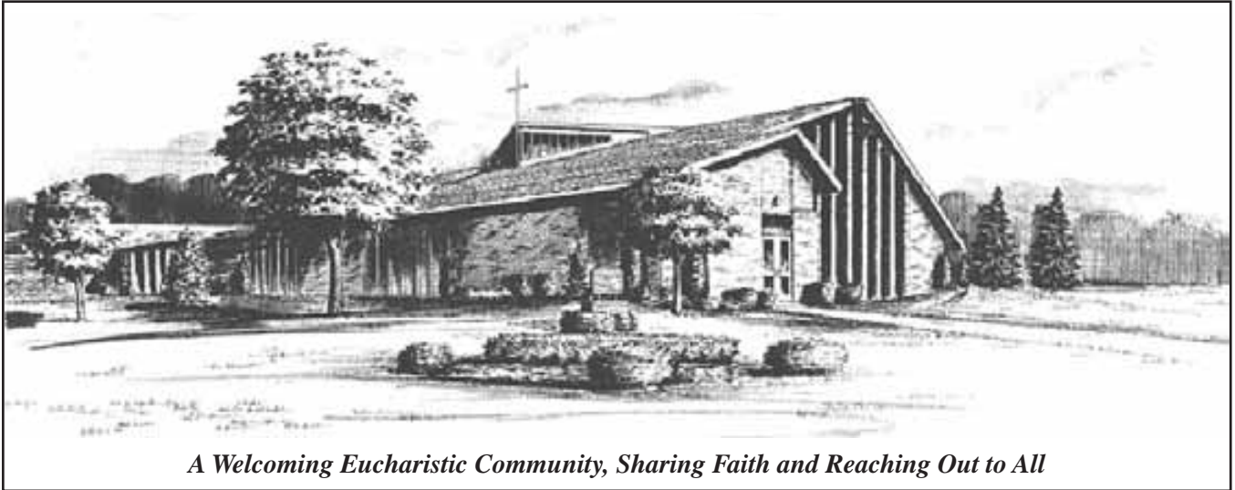
A Welcoming Eucharistic Community, Sharing Faith and Reaching Out to All

511 CHEAPSIDE ST., LONDON, ONTARIO N5Y 3X5 PHONE 519-433-6689 FAX 519-433-2301 E-MAIL: stmichlon@dol.ca www.stmichaels.dioceseoflondon.ca